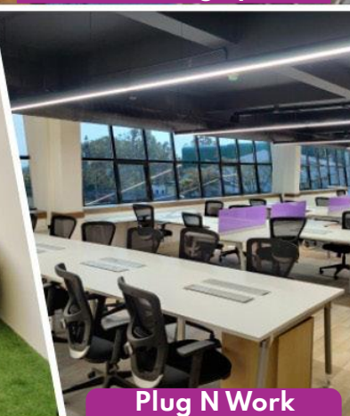
Plug N Work